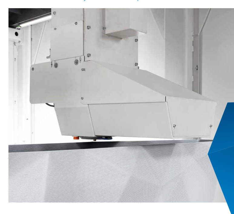
The high-performance printCore extruder is the key component of the powerPrint system.

The heart of powerPrint is the high-performance Printcore extruder. Available with a maximum output capacity up to 30 kg per hour, it also meets the highest requirements in an industrial environment. The robust design is designed for continuous operation. Reliability, maximum availability and uniform performance over the service life set the design apart.